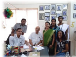
Outpatient cleft clinic at the Charles Pinto Centre with aart of the team